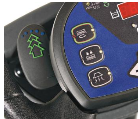
One paddle activates & de-activates the Ecoflex system