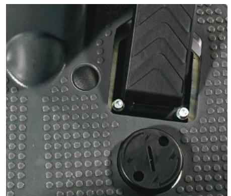
Fully adjustable traction pedal can be aligned with the operators choice of driving position